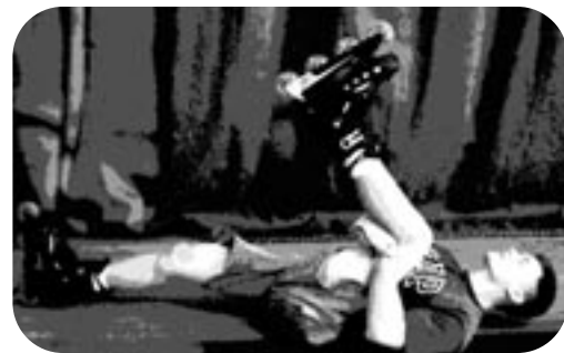
Hamstrings & Gluteals