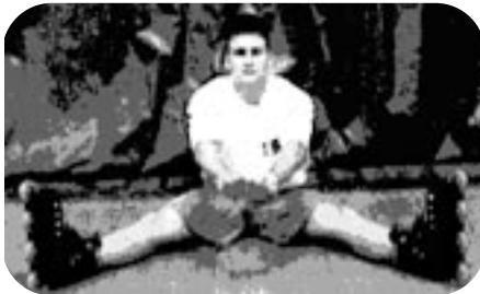
Hamstrings & Low Back