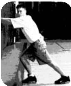
Gastrocnemius & Soleus (Bent knee)

Stretch the major muscles of the upper and lower body. If time is a factor then spend less time on the upper body stretches, because inline skating mainly uses the lower body musculature for locomotion.