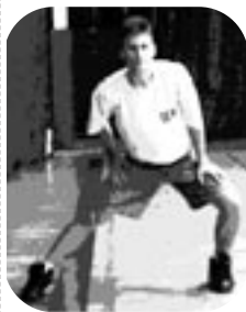
Adductors Place toes up and weight on heel to stretch hamstring.