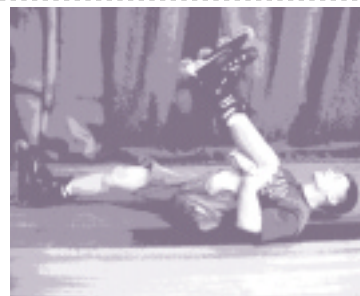
Hamstrings & Gluteals