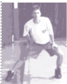
Adductors Place toes up and weight on heel to stretch hamstring.