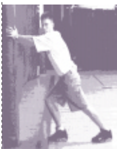
Gastrocnemius & Soleus (Bent knee)

Stretch the major muscles of the upper and lower body. If time is a factor then spend less time on the upper body stretches, because inline skating mainly uses the lower body musculature for locomotion.