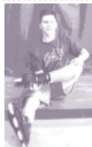
Internal Hip Rotators