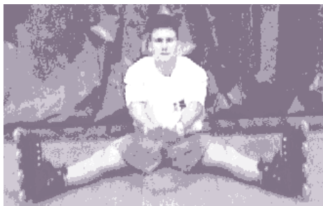
Hamstrings & Low Back